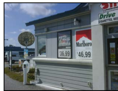
Exceeding Total Sign Square Footage