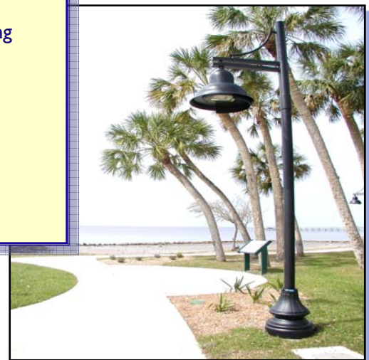
Bayshore Live Oak Park