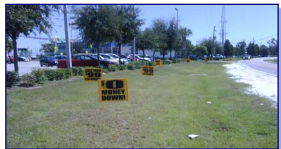
Snipe Signs do not meet codes