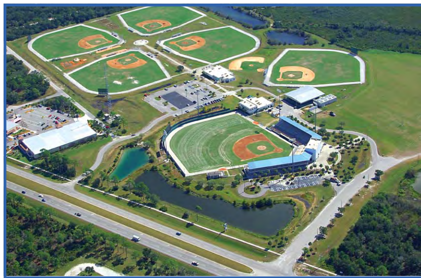
Charlotte Sports Park, 2300 El Jobean Rd., Port Charlotte

PLAY BALL! The Tampa Bay Rays are settling in at the newly renovated Charlotte Sports Park. As part of the $27 million dollar renovation, the stadium has been completely refurbished. The existing seating bowl showcases a 360 degree fan-friendly pedestrian concourse, a new luxury suite level, two outfield berms, a tiki bar, a children's play area, and new group areas. The new stadium contains approximately 6,000 fixed seats plus another 1,500 seats in the general admission areas. In addition, a new 40,000 square foot building houses administrative offices and brand new major and minor league clubhouses. Funding for the renovations came from a State of Florida grant, tourist tax and the Tampa Bay Rays. Total cost for the renovations - $27,300,000. For more information about the Charlotte County Sports Park please call 941.743.2425.