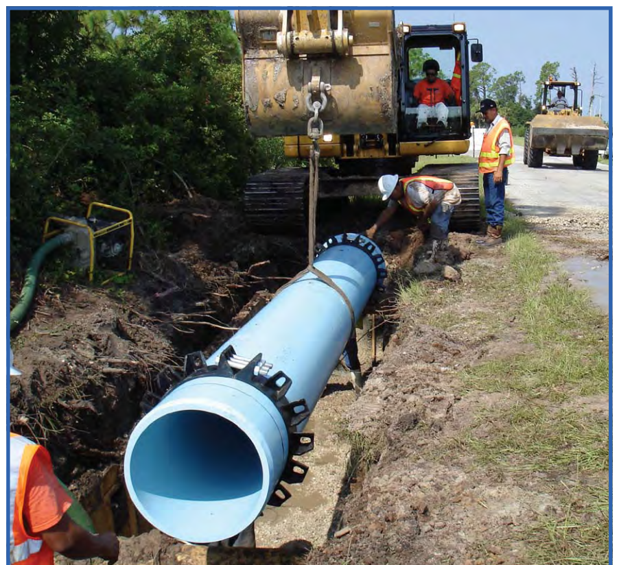
Seyburn Terrace Water Main