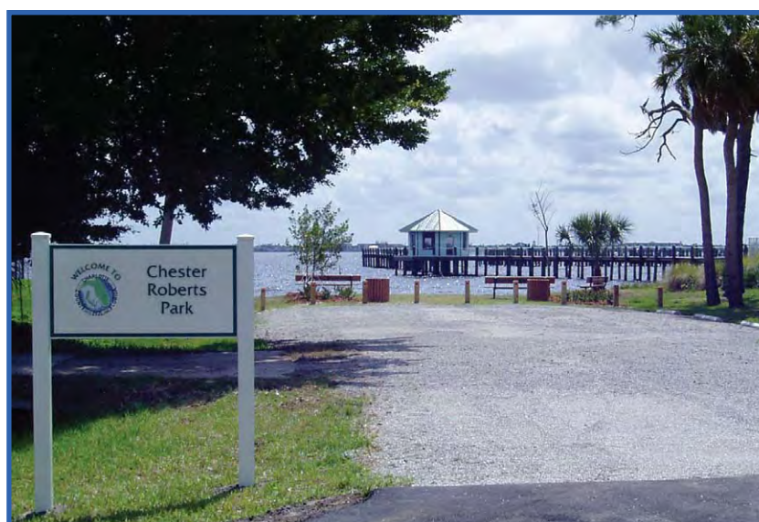
Chester Roberts Park, 5084 Melbourne St., Charlotte Harbor