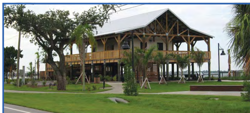
Bayshore Live Oak Park, 23157 Bayshore Rd., Charlotte Harbor