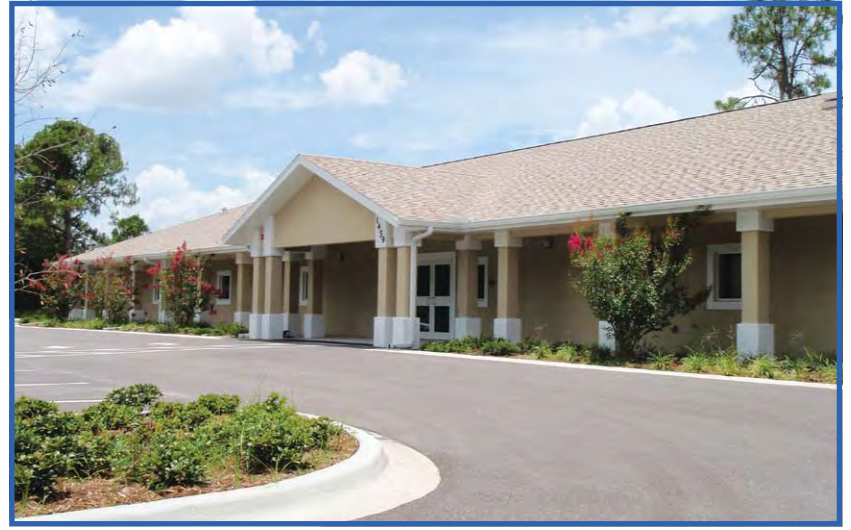
Genesis Safe House