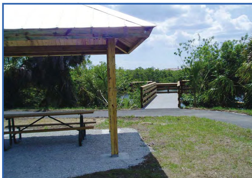
Sunrise Park, 20499 Edgewater Drive, Port Charlotte