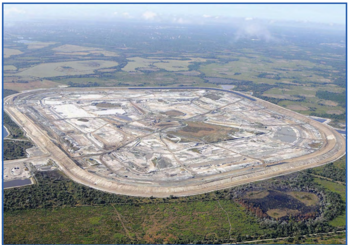
Reservoir photo courtesy of Aerial Innovation Inc. of Tampa

Construction on the facility expansion and new reservoir began in 2007. The facility is nearing completion and the new reservoir will be completed by July 2009. The expansion program is being cooperatively funded by the Authority members, including Charlotte County, the Southwest Florida Water Management District, the U.S. Environmental Protection Agency and state funding. Total project cost is $167.19 million. Charlotte County Utilities portion is $25,675,900.