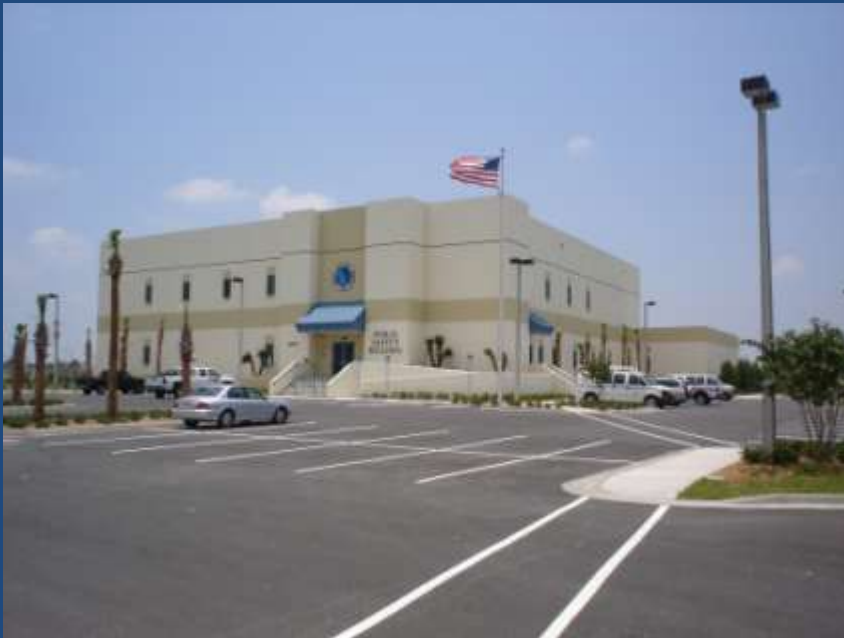
Public safety building