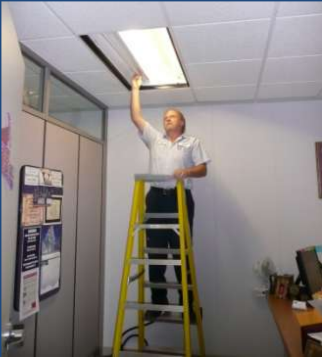
Light bulb replacements