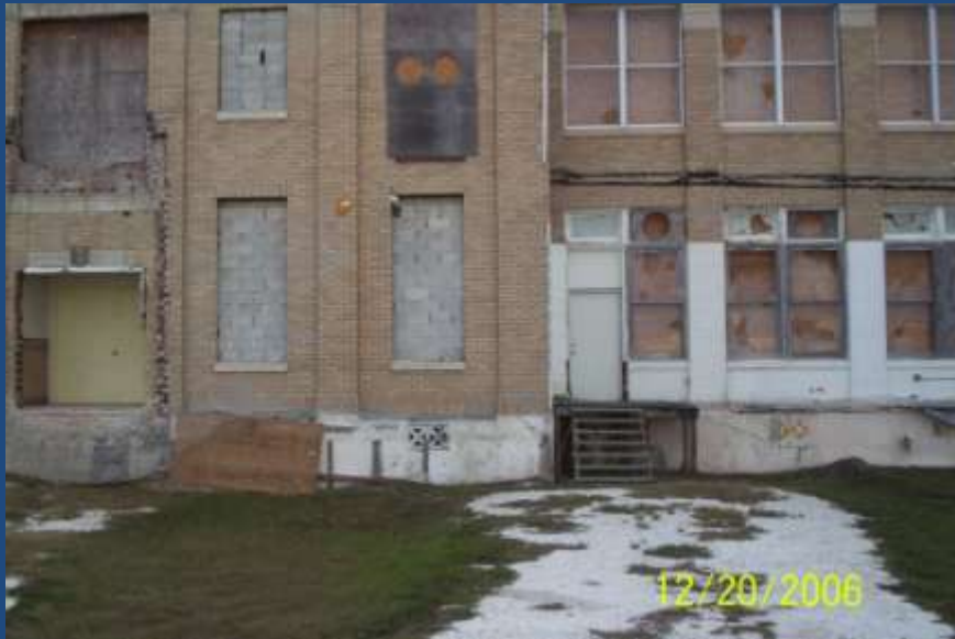
After Hurricane Charley