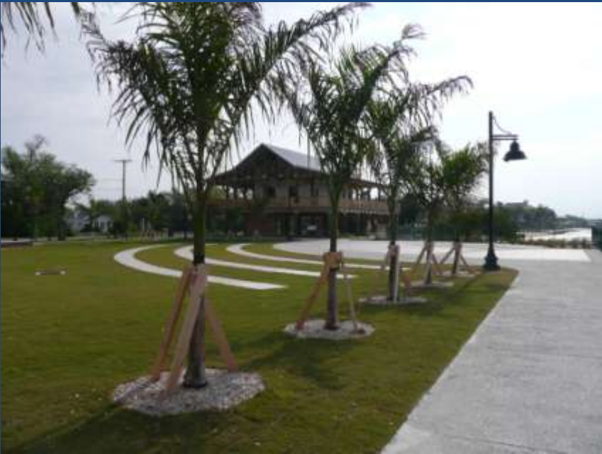
Bayshore Live Oak Park