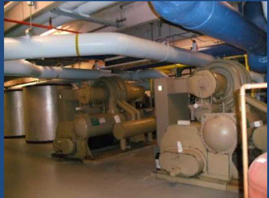
Ice bank air conditioning system