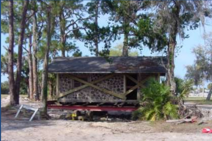
Cookie House at the original location