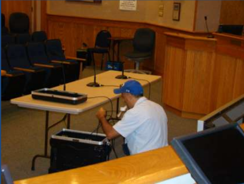
Staff setting up for public meetings