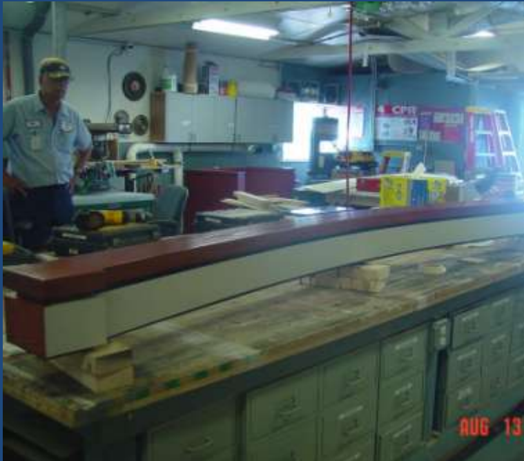
Reception/security desk being built