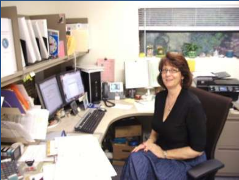
Administrative support staff