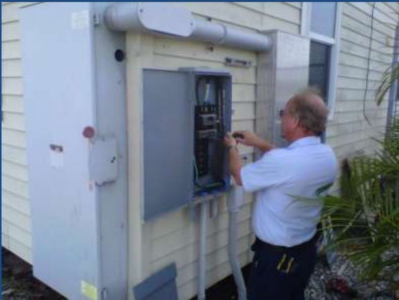
Removing 600 amp service panel