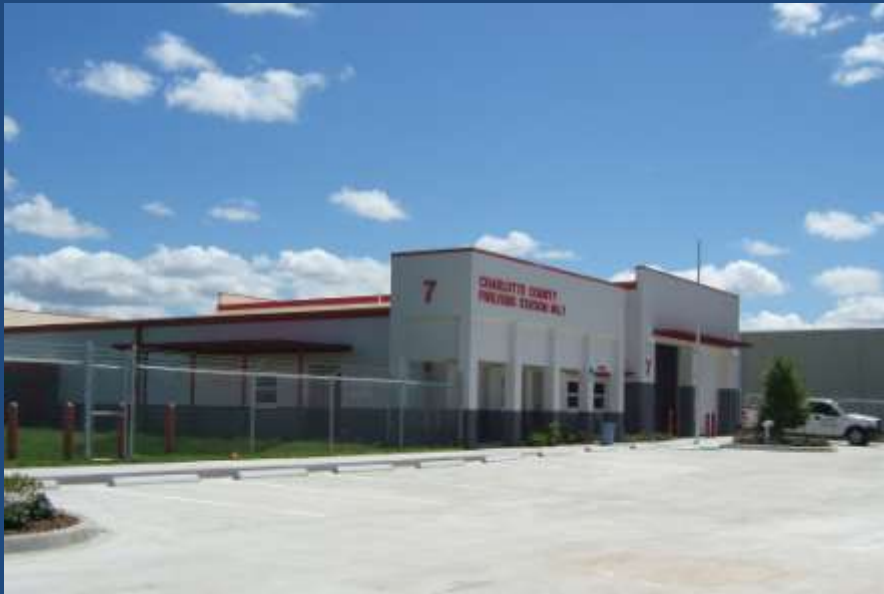
Fire Station 7, located at the Punta Gorda Airport