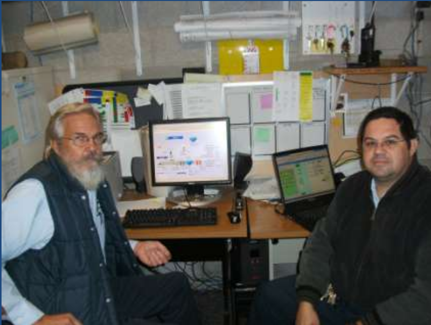
Computer controlled chiller system