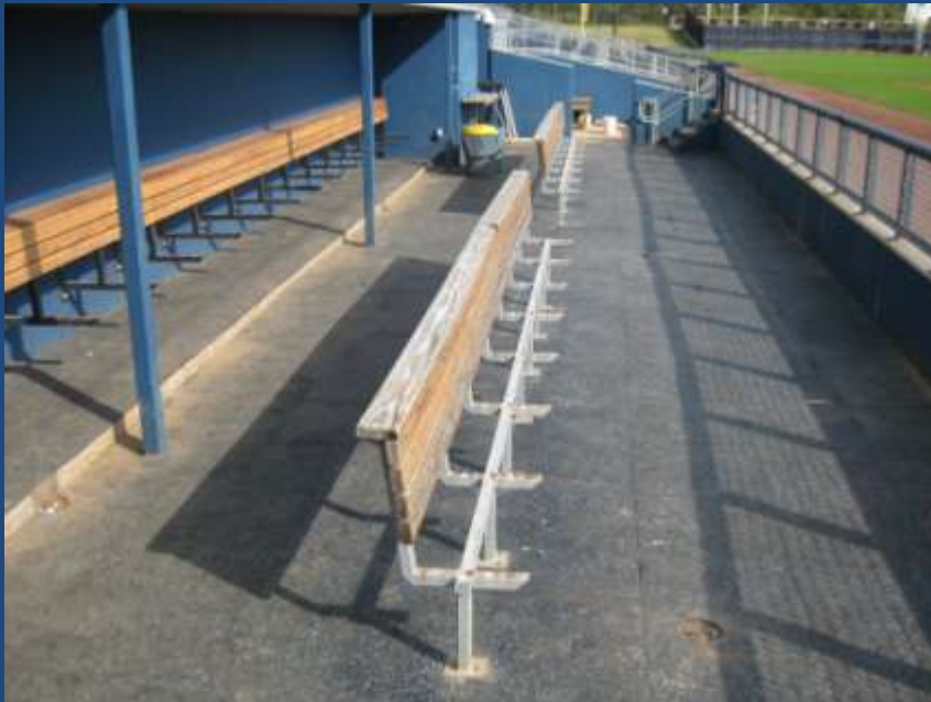
Replacing dugout seating