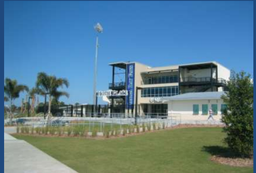
Home plate entrance into the spring training stadium