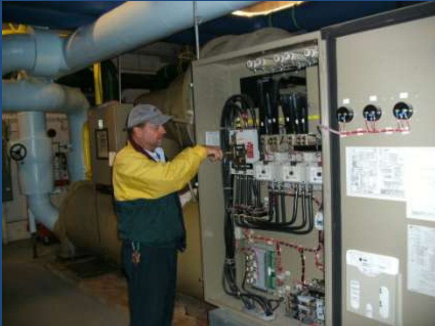
Checking chiller equipment