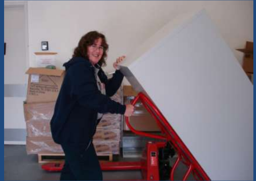
Moving & rehousing staff for better efficiencies