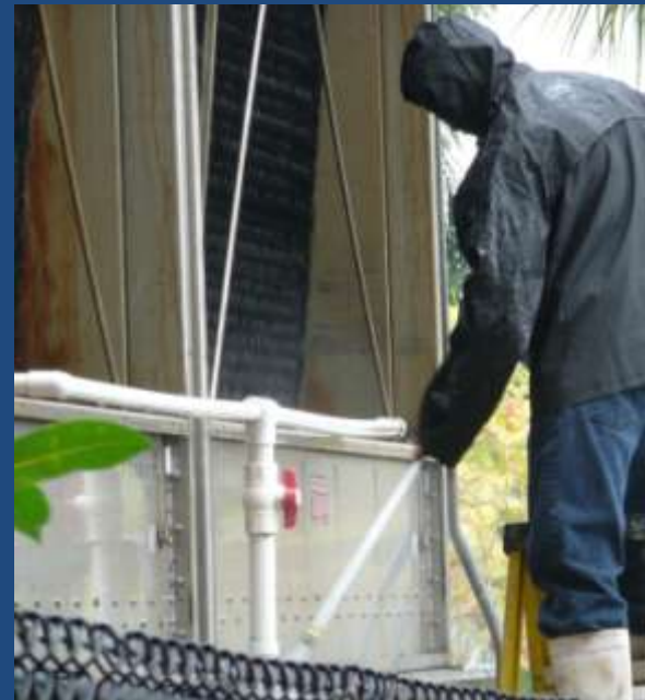
Pressure washing an air conditioning tower