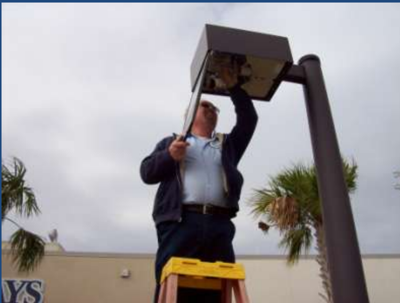
Repairing 480 volt light