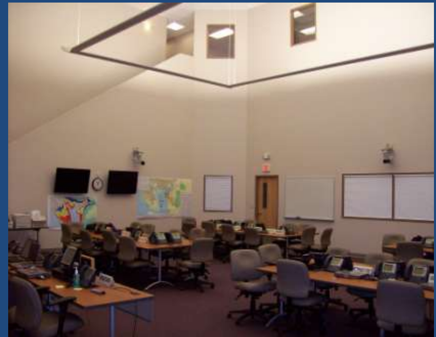
Emergency operations housed in the center of the building