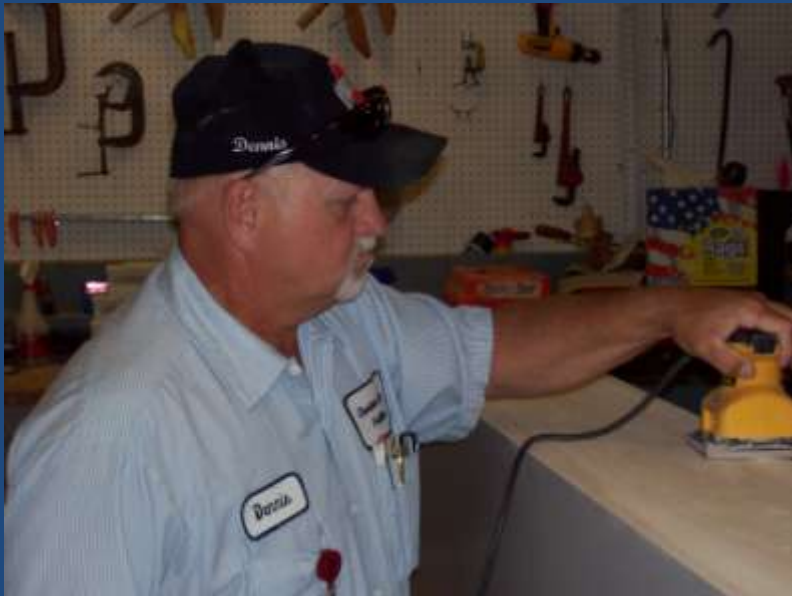
Building a cabinet