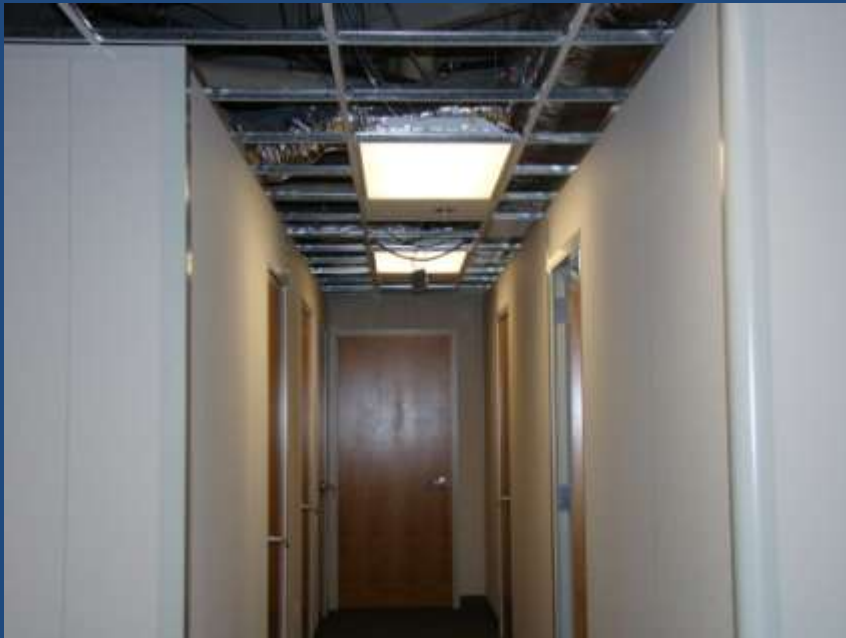
Renovating an office

Sealing walkways to prolong the lifecycle