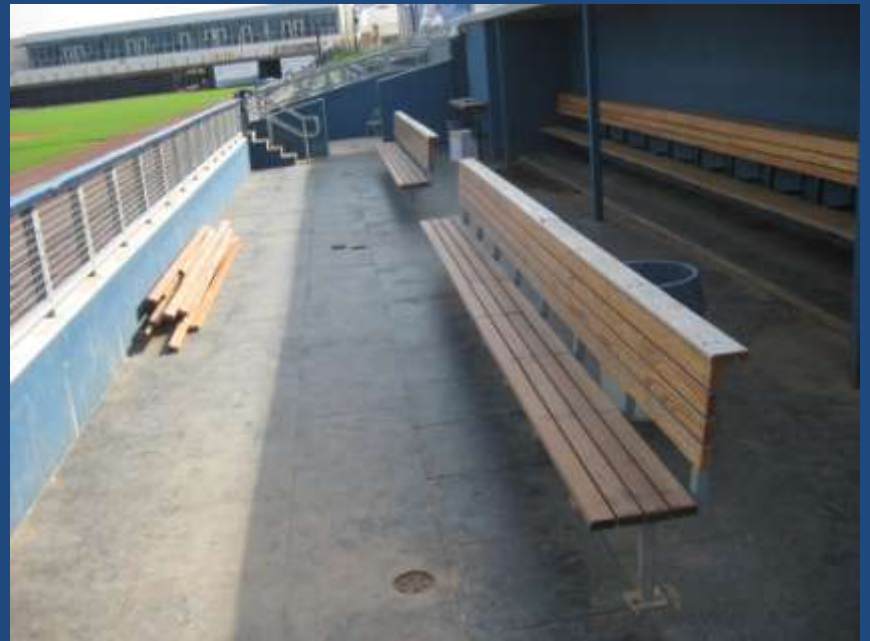
New seat boards